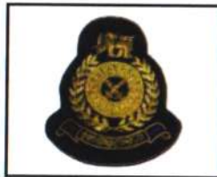
Brig & Col